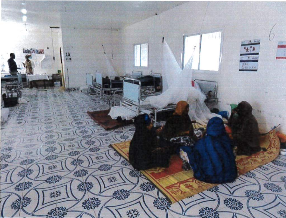
Bedroom in Salahley

means of a memorandum of understanding (MoU) through the Ministry of Health and concludes separate MoUs with another local NGO, the Manhal Charity Organization, and the Swiss organizations.